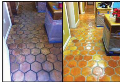
Before and After a Saltillo Tile Cleaning